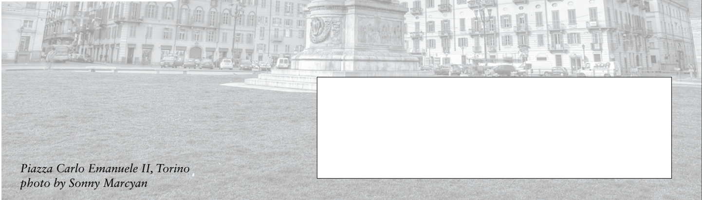
Piazza Carlo Emanuele II, Torino

NON - PROFIT U.S. Postage PAID San Diego, CA. Permit No. 1869