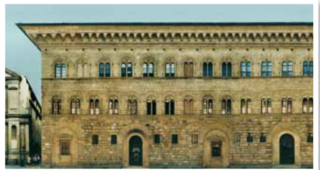
Palazzo Medici — Firenze