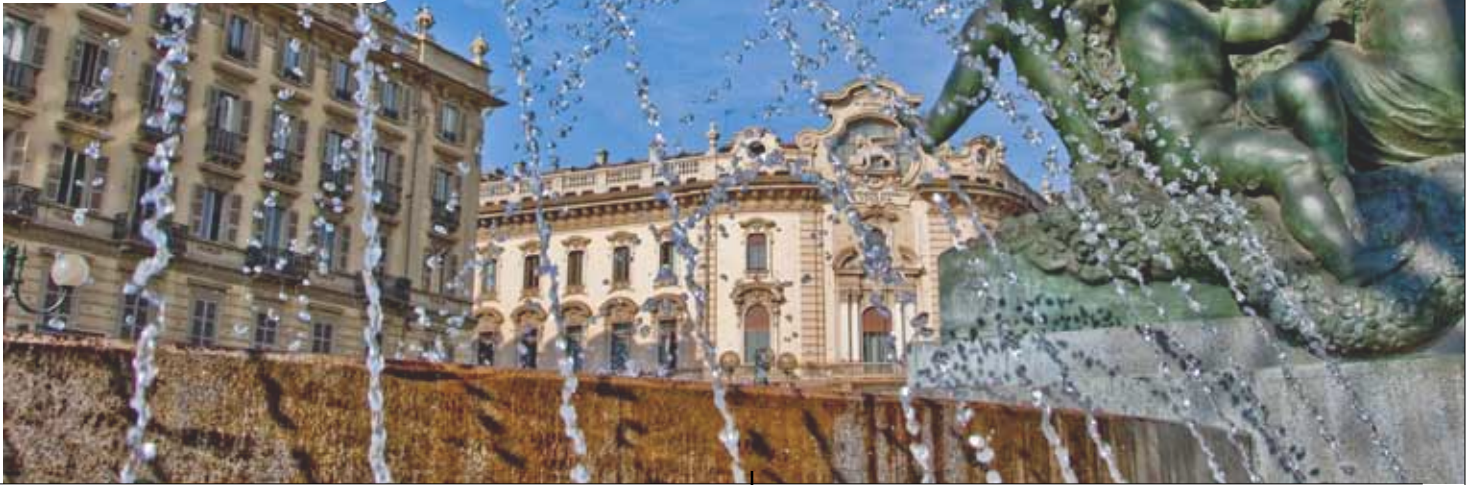
Piazza Solferino, Torino

As you know, the ICC is a non-profit organization and we need all the support we can have from our members in order to be able to continue our programs.